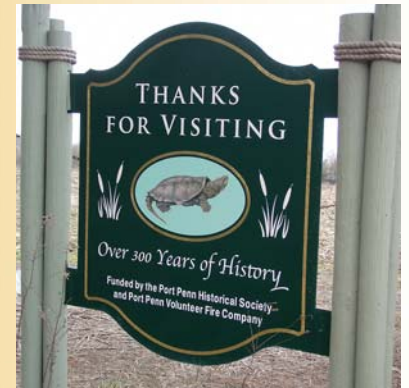
Snapping Turtle Chelydra serpentina