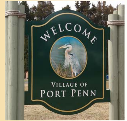
Great Blue Heron Ardea herodias