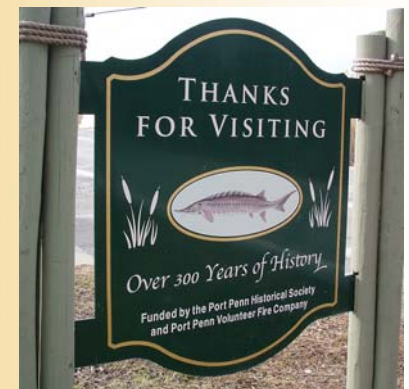
Atlantic Sturgeon Acipenser oxyrinchus