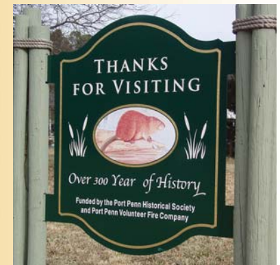
Muskrat Ondatra zibethicus